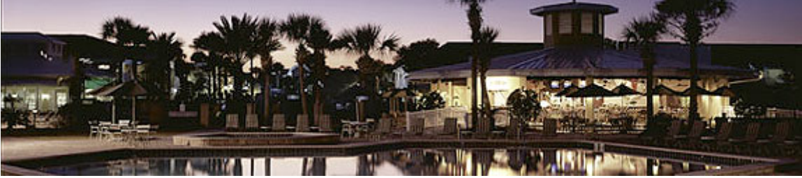
Site of 2006 Southern Association of Agricultural Scientists Convention